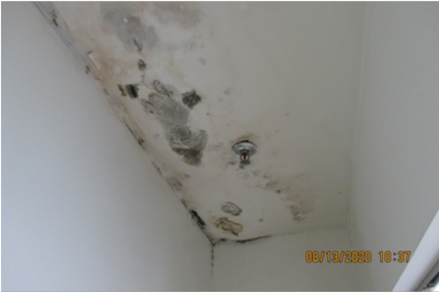
8/25/2020, 10:30:02 AM