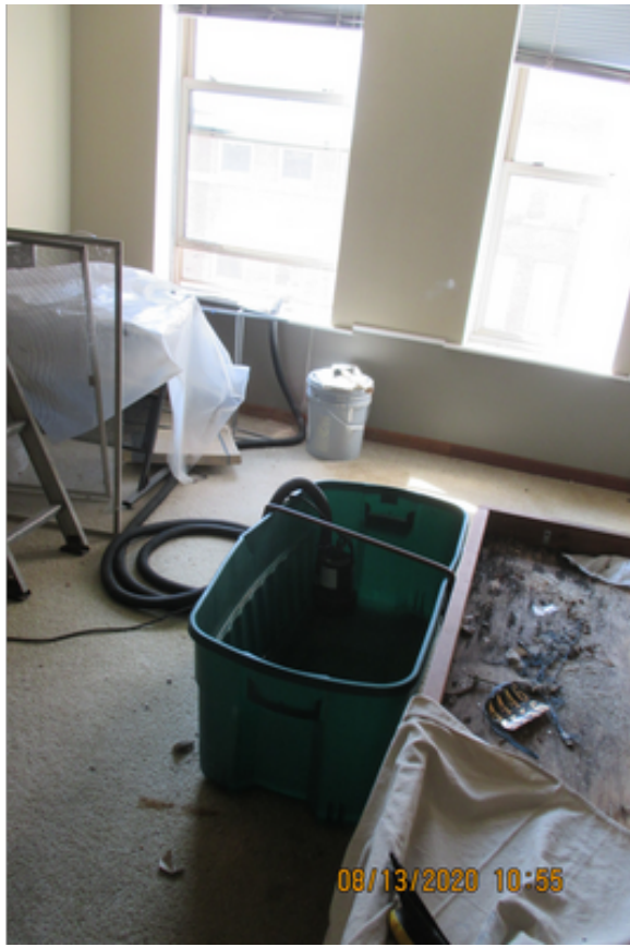
8/25/2020, 10:30:02 AM