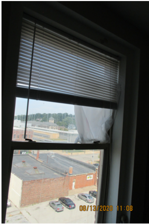
8/25/2020, 10:30:31 AM