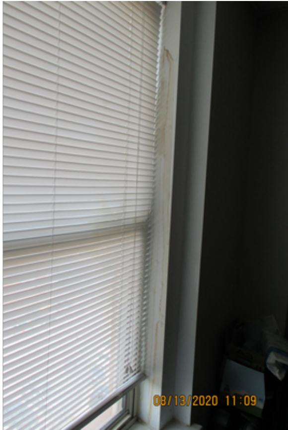
8/25/2020, 10:30:31 AM