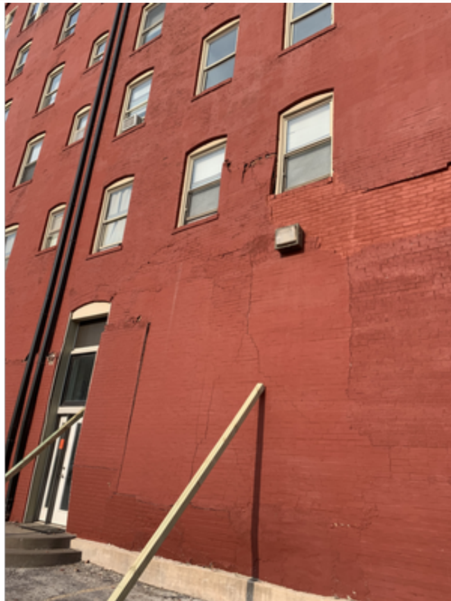
5/25/2023, 07:54:53 AM