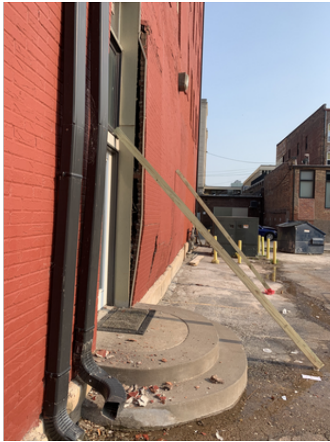
5/25/2023, 07:54:52 AM